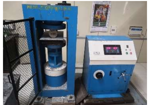
Fig2:Splitting tensile strength