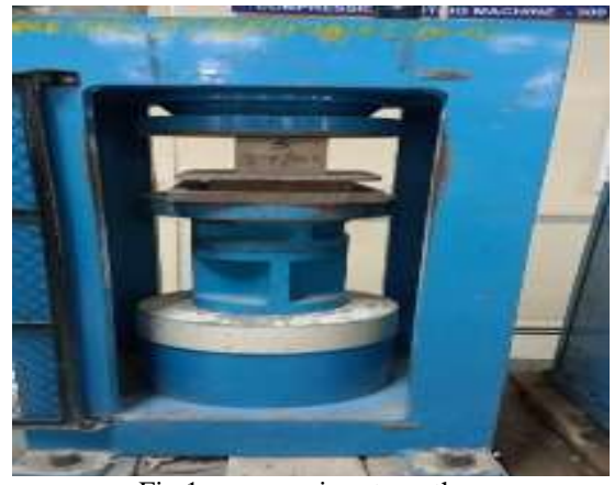
Fig 1:compressive strength