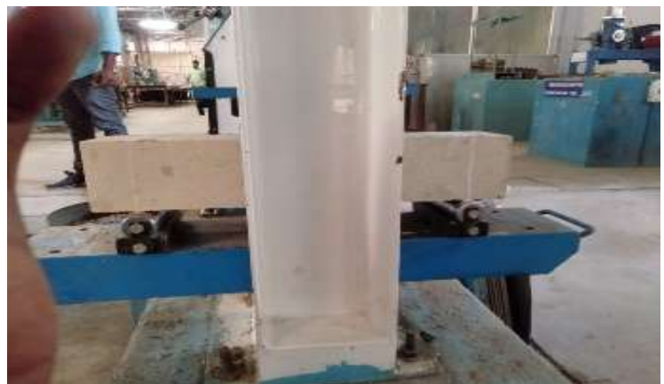
Fig 3:Flexural strength